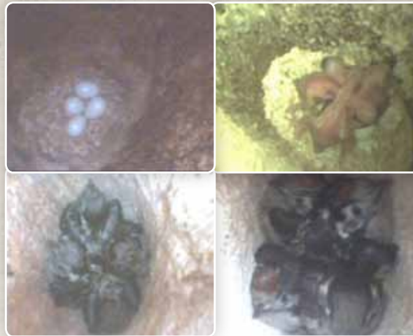
Figure 3. Cavity inspection cameras were used to monitor all but the highest nests. Images such as the above were used to measure clutch and brood size and to age chicks to predict fledging date. Older chicks could even be sexed in the cavity from the amount of red on their heads. Steve Dodd.

reported previously from the UK (Glue & Boswell 1994). The number of chicks fledged from successful nests is also lower at 2.8 compared to previous work in the UK reporting 4.2 (Glue & Boswell 1994) and also work on the species on the continent (Wiktander et al. 2001). We have found nest survival to be linked to provisioning rates, indicating that food supply may be limiting. The commonest cause of nest failure is loss of an adult and subsequent starvation of chicks. It is commonplace in Lesser Spotted Woodpecker breeding ecology for the female to desert and leave the male to sole parental