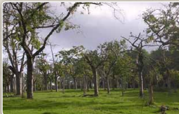
Figure 1. Lesser Spotted Woodpeckers are found in a variety of areas in the Wyre, including alongside streams where they often use alders, and orchards where there is often a large amount of dead wood for nesting.