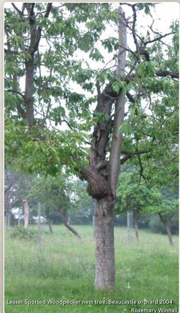
Lesser Spotted Woodpecker nest tree, Beaucastle orchard 2004